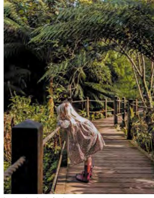
The Lost Gardens of Heligan